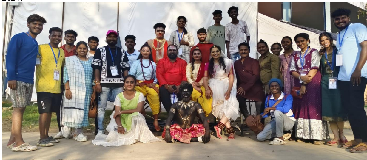
Group photo at 37TH INTER - UNIVERSITY NATIONAL YOUTH FESTIVAL (HUNAR – 2024)