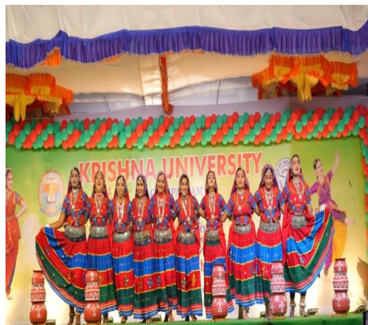
Performing FOLK ORCHESTRA FOLK DANCE at KRISHNA UNIVERSITY INTER COLLEGIATE YOUTH FESTIVAL (KRISHNA TARANG – 2023)