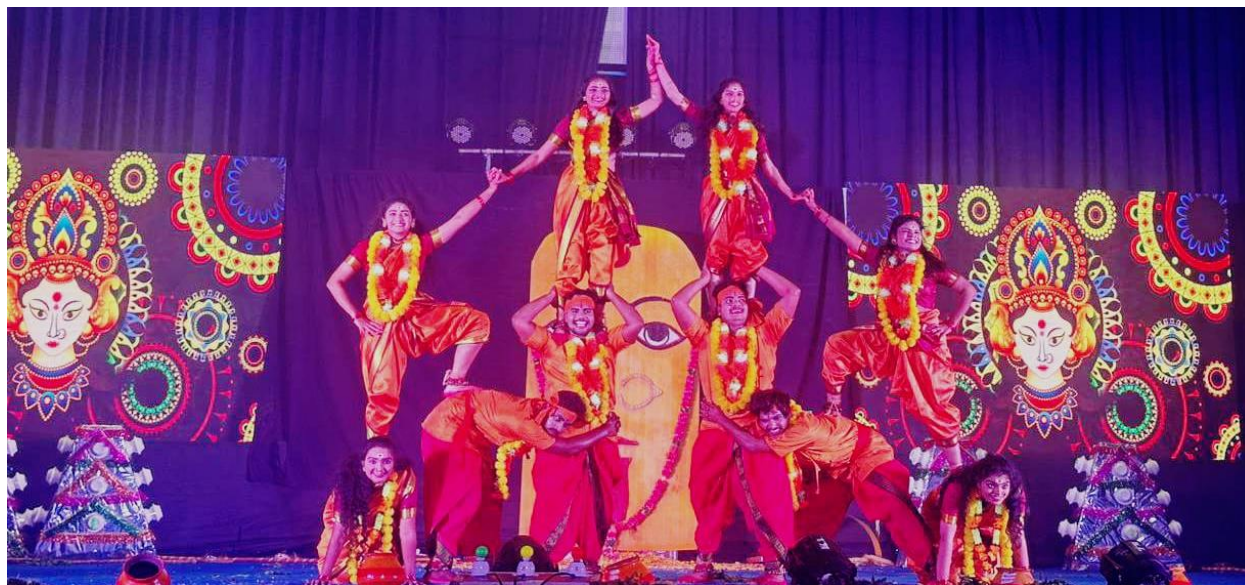
Performing folk dance (GANGA JATHARA) at 37TH SOUTH ZONE INTER - UNIVERSITY YOUTH FESTIVAL (YUVA BHERI 2023–2024)