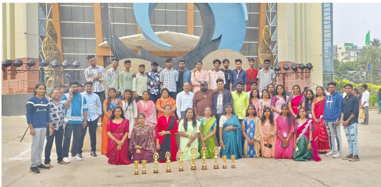
Group photo at 37TH SOUTH ZONE INTER - UNIVERSITY YOUTH FESTIVAL (YUVA BHERI 2023–2024)