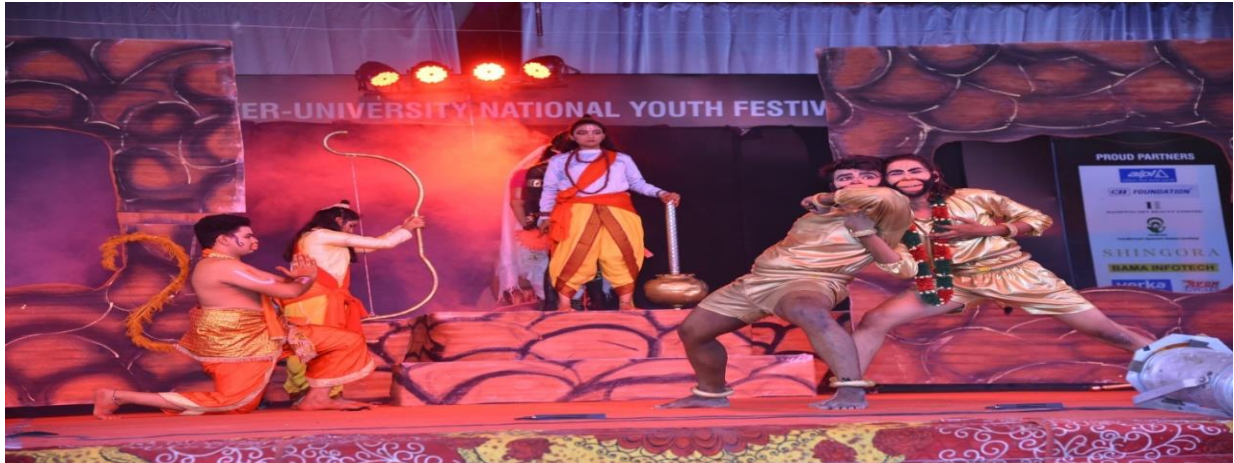
Performing ONE ACT PLAY at 37TH INTER - UNIVERSITY NATIONAL YOUTH FESTIVAL (HUNAR – 2024)