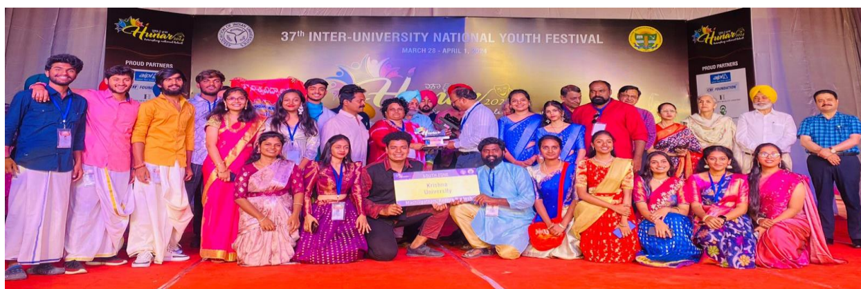
Receiving prizes in 37TH INTER - UNIVERSITY NATIONAL YOUTH FESTIVAL (HUNAR – 2024)