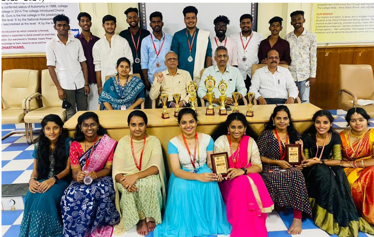
Success meet for winning in at 37TH SOUTH ZONE INTER - UNIVERSITY YOUTH FESTIVAL and selected for NATIONALS.