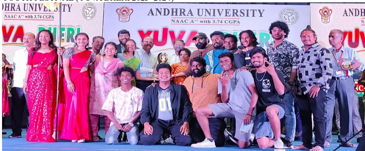
Receiving prizes at 37TH SOUTH ZONE INTER - UNIVERSITY YOUTH FESTIVAL (YUVA BHERI 2023–2024)