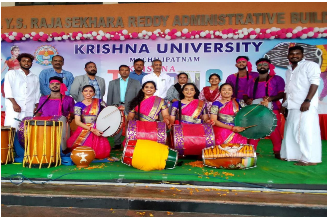
FOLK ORCHESTRA GOT FIRST PLACE IN KRISHNA UNIVERSITY INTER COLLEGIATE YOUTH FESTIVAL