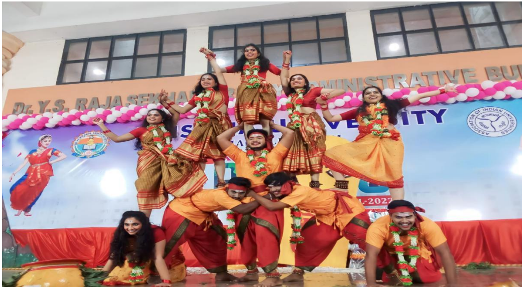
FOLK DANCE PERFORMANCE AT KRISHNA UNIVERSITY INTER - COLLEGIATE YOUTH FESTIVAL