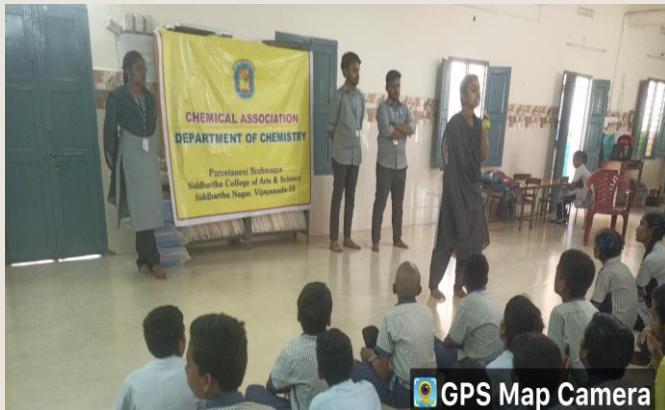
Neighborhood activity, awareness about Pollution by M.Sc (Final) students at Vijaya Marry Integrated Institute, Gundala, Vijayawada on 27th June, 2023.