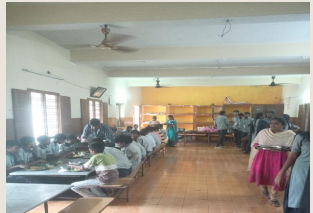
An extension activity provided lunch to the physically challenged & visually Challenged Students of Vijaya Marry Integrated Institute for the Blind, Gundala, Vijayawada on 27 th June 2023.

Punctuality is not about being on time, It's basically about respecting your own commitments.. A.K. Birla APJ Abdul Kalam